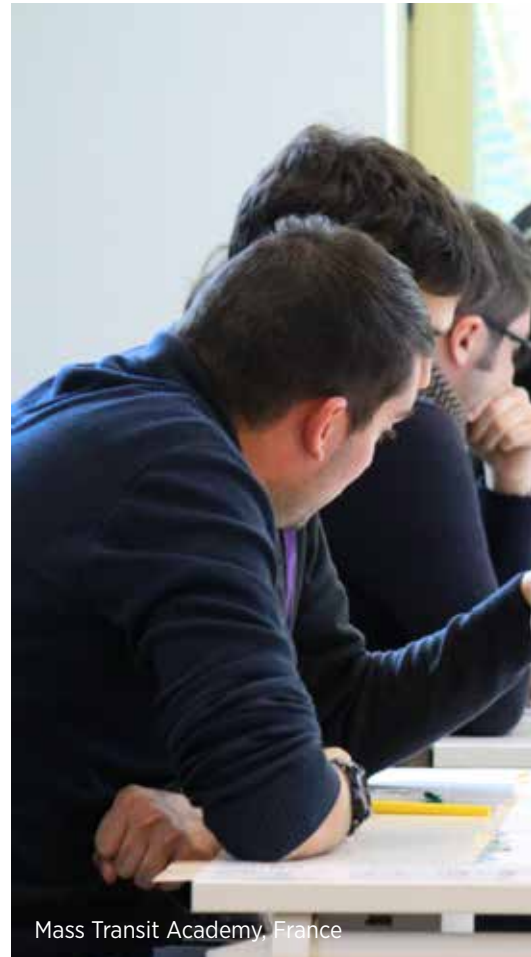
Mass Transit Academy, France